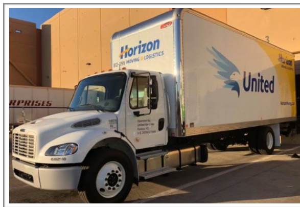
The first Horizon truck arrives in Tucson.

The acquisition will allow for a greater Arizona footprint and for Dircks to emphasize